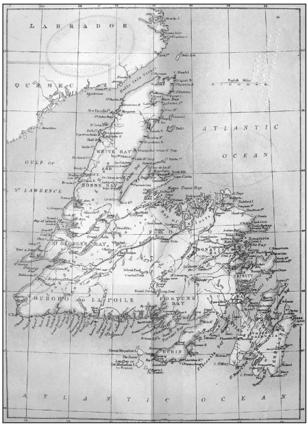
Figure 1. Title page and map insert from Harvey's Text-book of Newfoundland History, for the Use of Schools and Academies, 1st ed. (Boston: Doyle and Whittle Publishers, 1885).<sup>29</sup> Memorial University of Newfoundland, Digital Archive Initiative, https://collections.mun.ca/digital/collection/cns/id/57625/rec/3.

The adoption of Harvey's book was supported by all the superintendents, who trumpeted his positive take on Newfoundland's history and potential. Harvey was himself ecstatic about the potential of his new monograph to shape teachers and students. He predicted a bright future for Newfoundland within the British Empire and instructed