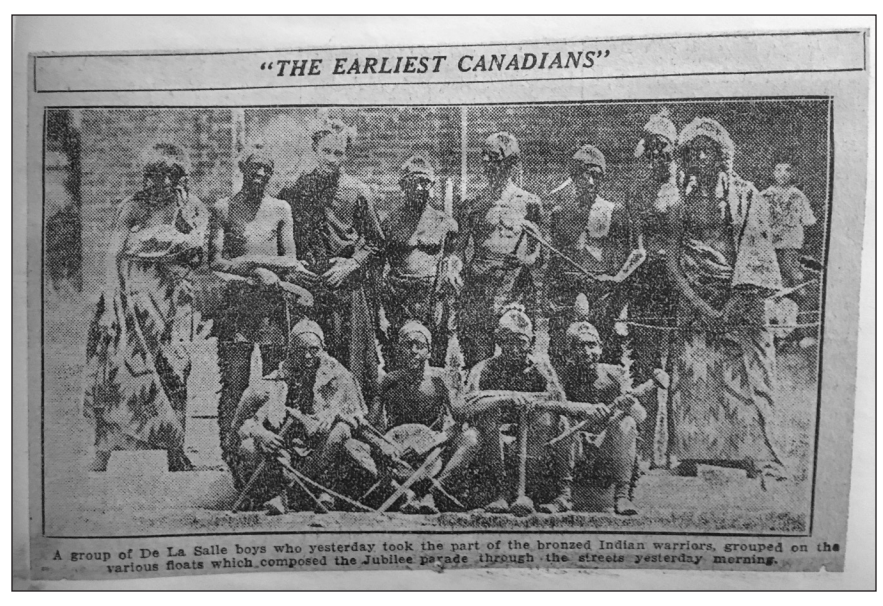
Figure 2. This photograph of the "Earliest Canadians" was published in the Mail and Empire on July 2, 1927. The caption reads: "A group of De La Salle boys who yesterday took the part of bronzed Indian warriors, grouped on the various floats which composed the Jubilee parade through the streets yesterday morning."

Machine."52 As the photograph of the float for the "Earliest Canadians" (see Figure 2) reveals, non-Indigenous schoolchildren dressed up and performed as stereotypical "Indians." As historian Sharon Wall has explained, it was common at the time for middle- and upper-class white children to "play Indian," especially in public performances and at summer camps.<sup>53</sup> In this case, boys from a local Catholic school, De La Salle College, acted as "bronzed Indian warriors." Unlike pageants performed for the federal government's celebrations in Ottawa, which included and encouraged the involvement of Indigenous communities, it appears from reports and photographs that there was little or no Indigenous involvement in the historical pageantry that took place in Toronto.54