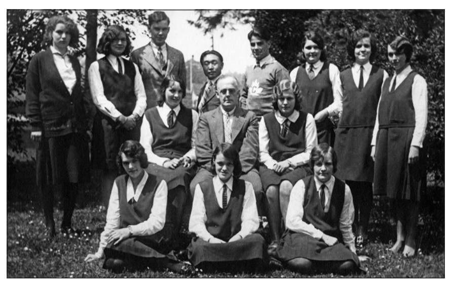
Figure 5. Students and their teacher at Columbian College in the early 1920s. Notice that the girls are wearing uniforms while the boys have jackets and ties. A Japanese student can be seen in the back row. New Westminster Archives, J. J. Johnston fonds, IHP7368-032.

Columbian College during the 1920s also appealed to parents of students who did not find success in the public system. Some students belonged to ethnic minorities. A student of Japanese descent enrolled as early as 1902, and between 1915 and 1925, several students with Japanese names attended Columbian College each year, many coming from the Japanese Mission in New Westminster and a few from Vancouver and even Tokyo.<sup>92</sup> Chinese names also appeared from time to time. Other students had parents who believed them to be "at risk" of leaving high school either because of poor social influences, single-parent or transient family life, or poor health. Some parents simply preferred a religious boarding school over a public high school as a stepping stone to a better life. A few male students were a little older, working to put themselves through high school, which they had been unable to attend earlier.<sup>93</sup>