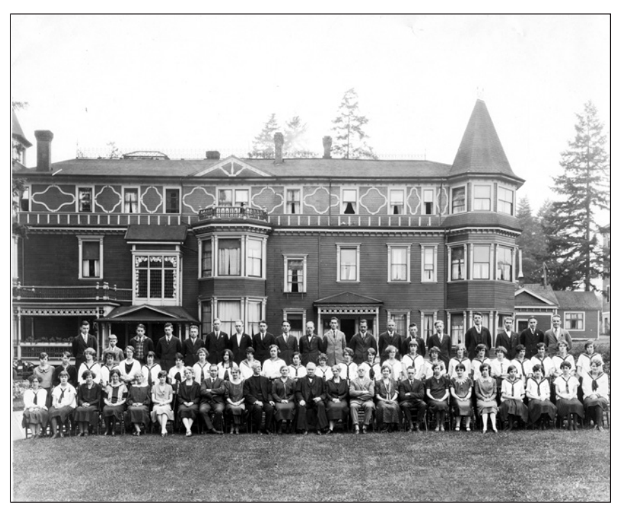
Figure 4. The staff and students of Columbian College assembled on the front lawn in the early 1920s. Such group photographs were taken annually.

With the university question settled, Columbian College curbed its ambitions and began working to survive in the new educational landscape. At least the collegiate high school aspect of Columbian College seemed stable; of 169 students enrolled at Columbian College in 1913–14, 39 took matriculation (university entrance) courses, down just a little from the 48 similarly enrolled in 1904.<sup>84</sup> In 1912, Columbian College directors asked the General Methodist Conference of Canada for permission to acquire more property in anticipation of growth in secondary education and subsequently purchased two additional properties in New Westminster. However, with McGill BC enrolling nearly three hundred students in 1913, Columbian College discontinued its university-level arts courses in 1914, the year before the University of British Columbia opened.<sup>85</sup>