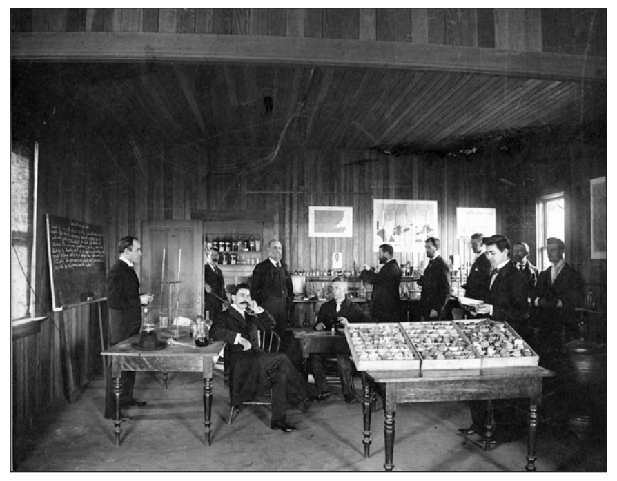
Figure 1. A science classroom at Columbian College in 1898.

Columbia College had a diverse, "modern" curriculum that reflected contemporary ideas about Canadian high schools, particularly in Ontario. As in Ontario, Columbian College presented itself proudly as the "downward extension of the university" rather than a continuation of elementary schools, teaching academic courses in English (composition, grammar, literature), mathematics (algebra and geometry), English and Canadian history, French, physics, chemistry, and Latin, a favourite subject at Victoria College in Ontario.<sup>57</sup> Theology students could also study Greek and topics relevant to ministry. The college reinforced its elite image through student recitals, literary publications, and "conversaziones" held regularly for local citizens. However, like many other high schools, the college quite willingly offered commercial courses useful to many young men and, increasingly, young women.<sup>58</sup>