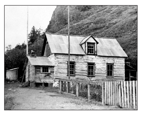
Figure 2: Telegraph Creek public school, 1952.

In November 1949, a new threeroom school was opened in Telegraph Creek, jointly funded by federal and provincial governments. It was officially designated as "integrated by the Telegraph Creek School district and the federal Minister of Citizenship and Immigration" after roughly 40 years of "unofficial" integration.43 However, due to lobbying by church officials, Catholic Indigenous children would no longer attend school alongside their non-Indigenous peers. Instead, Catholic Indigenous children who once