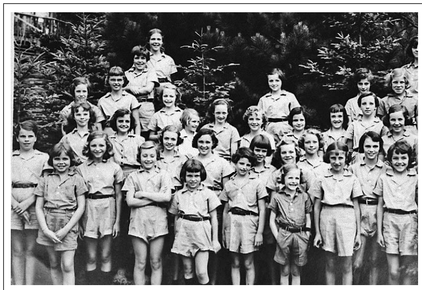
Camper at Camp Tanamakoon, c. 1930s.