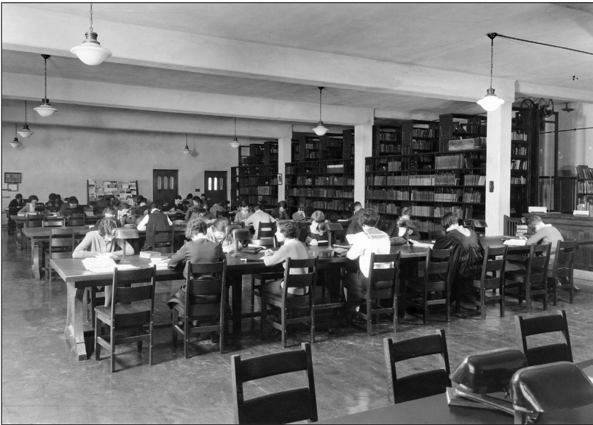
Figure 1. Western's Reading Room, Arts Building basement, 1927. "Way We Were Collection," AFC 363-S6.