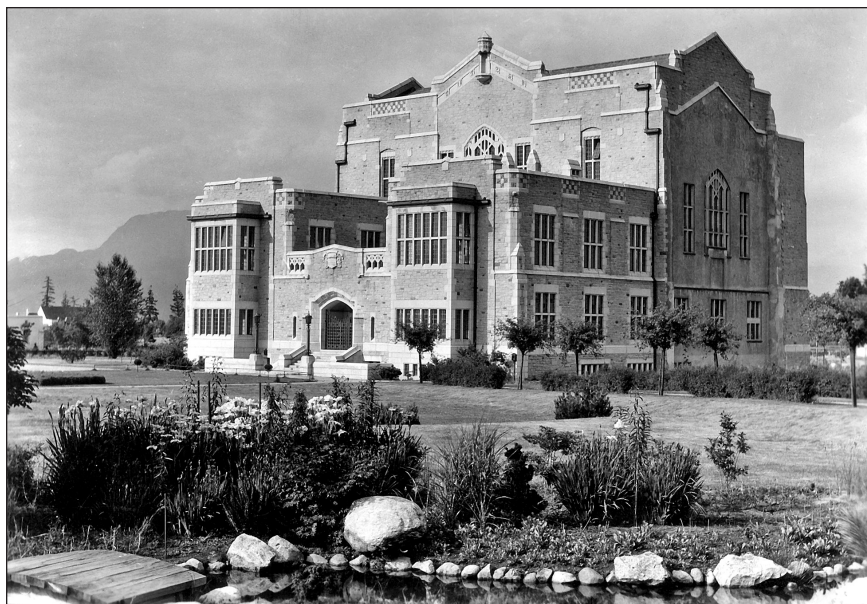
Figure 5. University of British Columbia, Main Library, 1932. Photographer, Philip Timms. UBC Archives, 1.1/1727.

per cent) of the 13,798 titles in the Shaw List. 63 The Globe skipped over the rationale for undergraduate reading entirely by highlighting Toronto's $15,000 grant as a way to free up space for advanced students and professors in the main library. 64