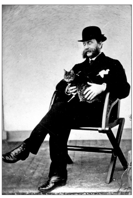
Figure 6: Governor Frederick Seymour.

Despite Seymour's swift action, "rumours" of an imminent "general insurrection" of Indigenous peoples circulated throughout British Columbia.<sup>65</sup> In an attempt to cultivate goodwill and avoid further costly conflicts, Seymour held the first of many successive gatherings of Indigenous groups at New Westminster to celebrate Queen Victoria's birthday in May 1864. At such a turbulent time, Seymour was conscious of the esteem with which many Indigenous peoples had held Douglas, and he wanted to counteract the impression that "their protector was withdrawn and would have no successor."66 Seymour created the ad hoc summit and invited groups from around the colony to attend as a show of power and to prove that he had "succeeded to all the power of my predecessor and to his solicitude for their welfare."67 At the gathering, Seymour announced: