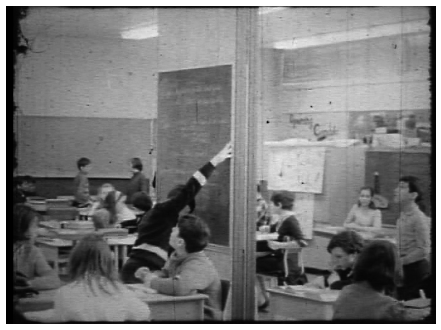
The walls come down between two classrooms, as seen in the film Learning to Learn (1966).

The first and most central conclusion displayed in the film was the need for a shift from a teacher-centred to student-centred vision of education. Kenn explains: