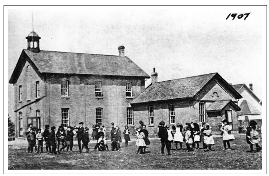
Figure 2: A photograph of the Arkona School from 1907. The main structure was completed in 1874 and the additional wing or 'annex' was built in 1876. The building to the right is the Arkona Methodist Church.

community of Port Franks. By the late 1870s the village boasted dozens of businesses and even an ambitious weekly paper The East Lambton Advocate . The school building was the most tangible monument to Arkona's ambitions. 14