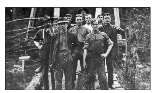
"A group of workers; Canadian, American, Swedish, Italian and Scots in a C.N.R. construction Camp," Agabob, BC, 1913.

In appearance there was nothing of the college man about [our teacher]. At sight no Alma Mater would have claimed him. Without doubt, nobody who had any acquaintance with students would have supposed that two months previous [this teacher] had carried off a scholarship in philosophy. The [teacher] I greeted was a navvy<sup>32</sup> pure and simple and he certainly looked the part.<sup>33</sup>